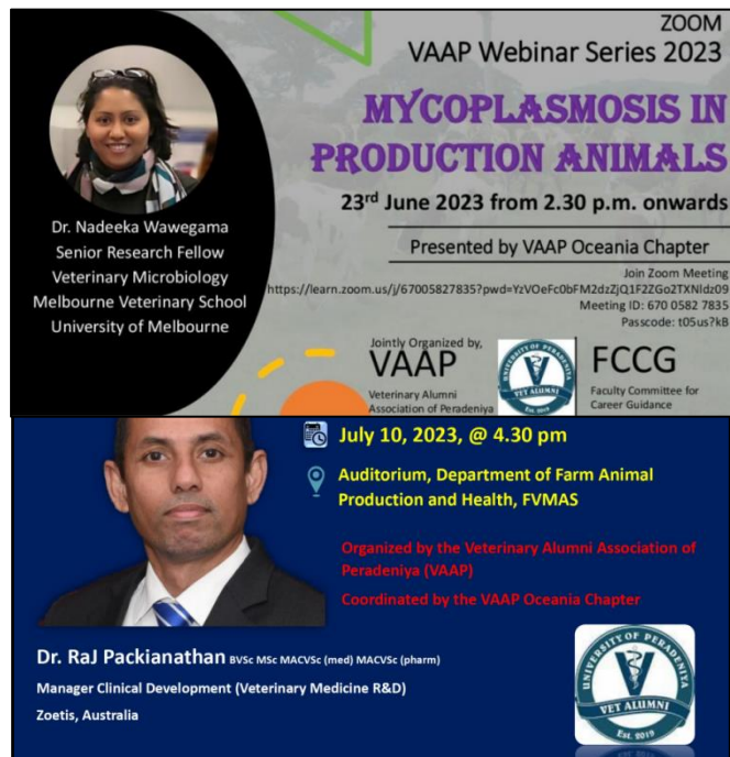
2023/2024 VAAP Webinar/ Seminar flyers