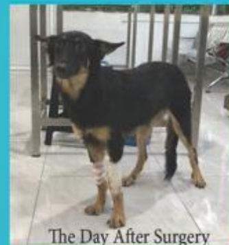
The Day After Surgery