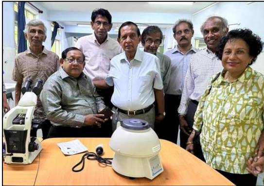
The bench-top centrifuge donated by the Vet 72 batch.

refurbishment enabled easier travel for students' field visits and academic activities, creating more chances for practical learning and collaborative research.