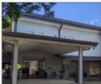
Farm Animal Veterinary Teaching Hospital.