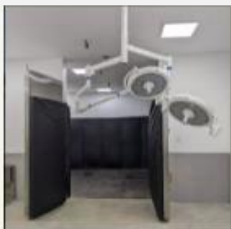
The equine surgery preparation room and the theatre.

Embark on a journey with VAAP to enhance the Farm Animal Veterinary Teaching Hospital at the University of Peradeniya! The recently expanded facilities include a more spacious outpatient department (OPD), cutting-edge sections for small ruminants and equine surgery, a pharmacy facility, expanded hospitalization spaces, and well-furnished student restrooms and discussion rooms.